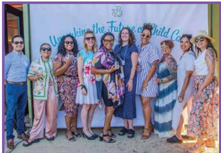
At the Child Care Law Center, we advocate, and litigate to make child care a civil right.