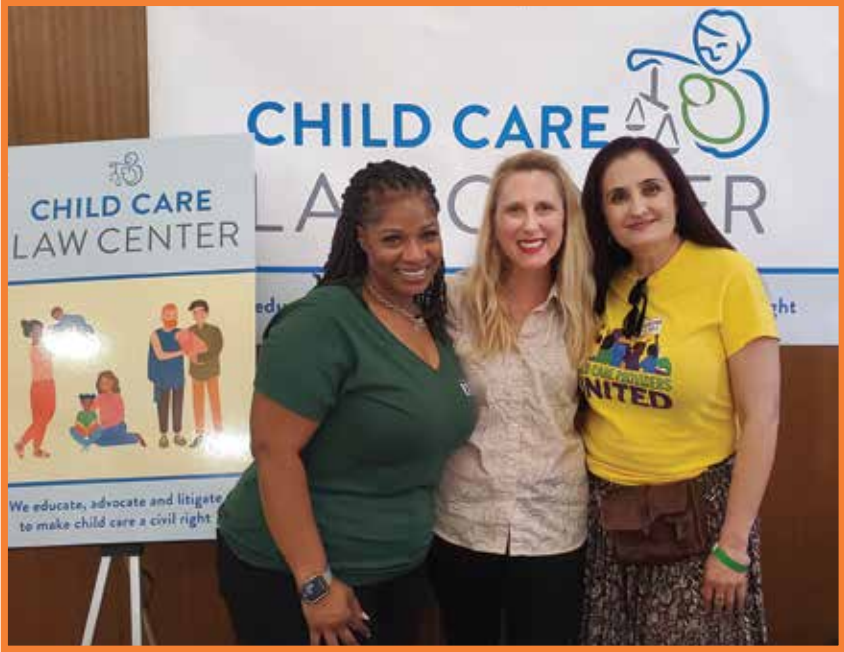
Child care providers lead the movement toward racial & social justice in child care.

Your support is helping us put an end to landlords' harmful intimidation tactics. By upholding the law, we make sure that child care providers are treated with the dignity and respect they deserve, now and in the future.